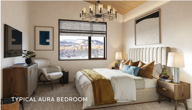
TYPICAL AURA BEDROOM