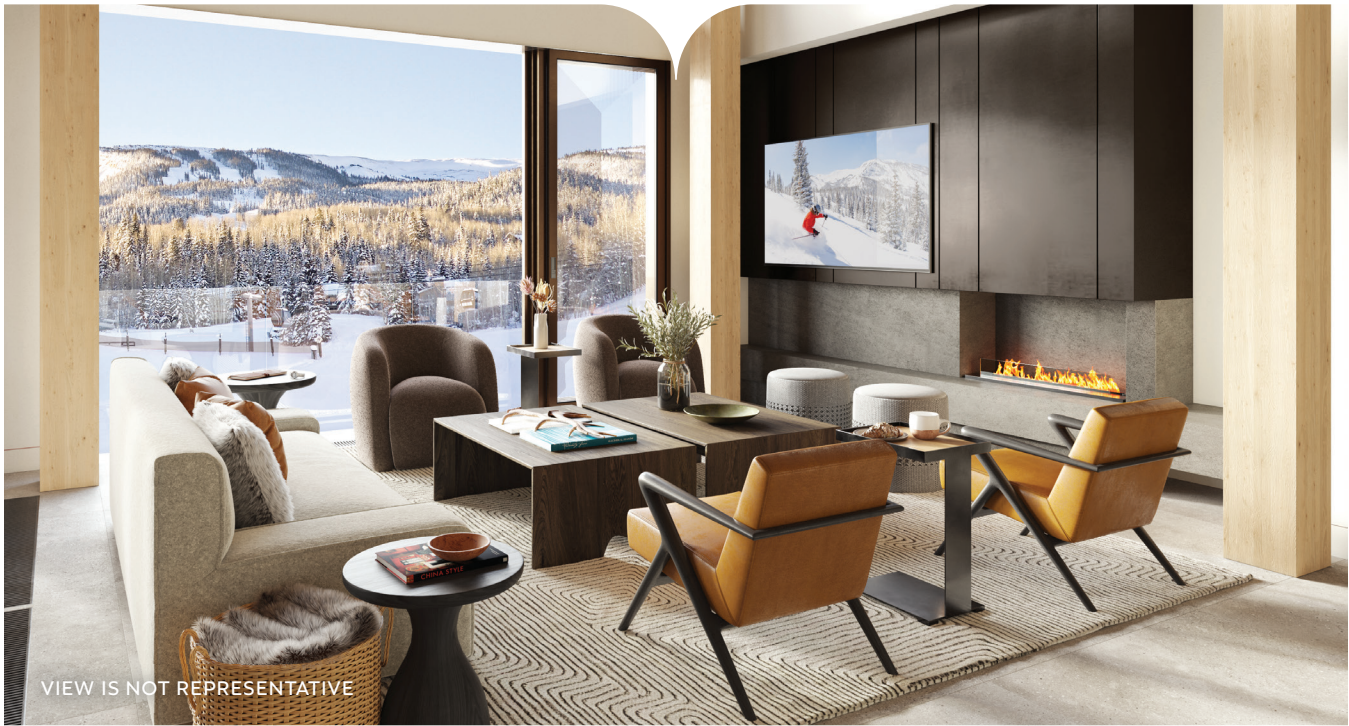
VIEW IS NOT REPRESENTATIVE