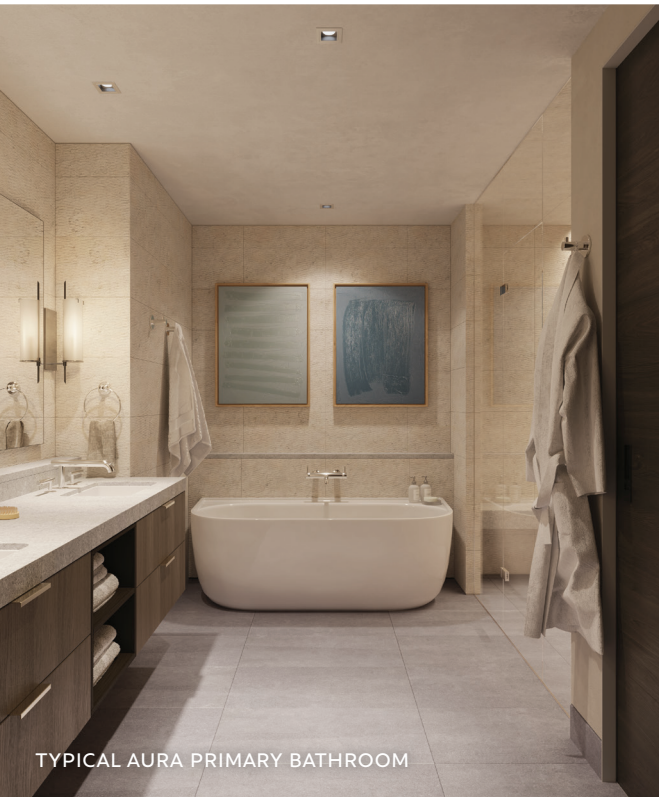
TYPICAL AURA PRIMARY BATHROOM