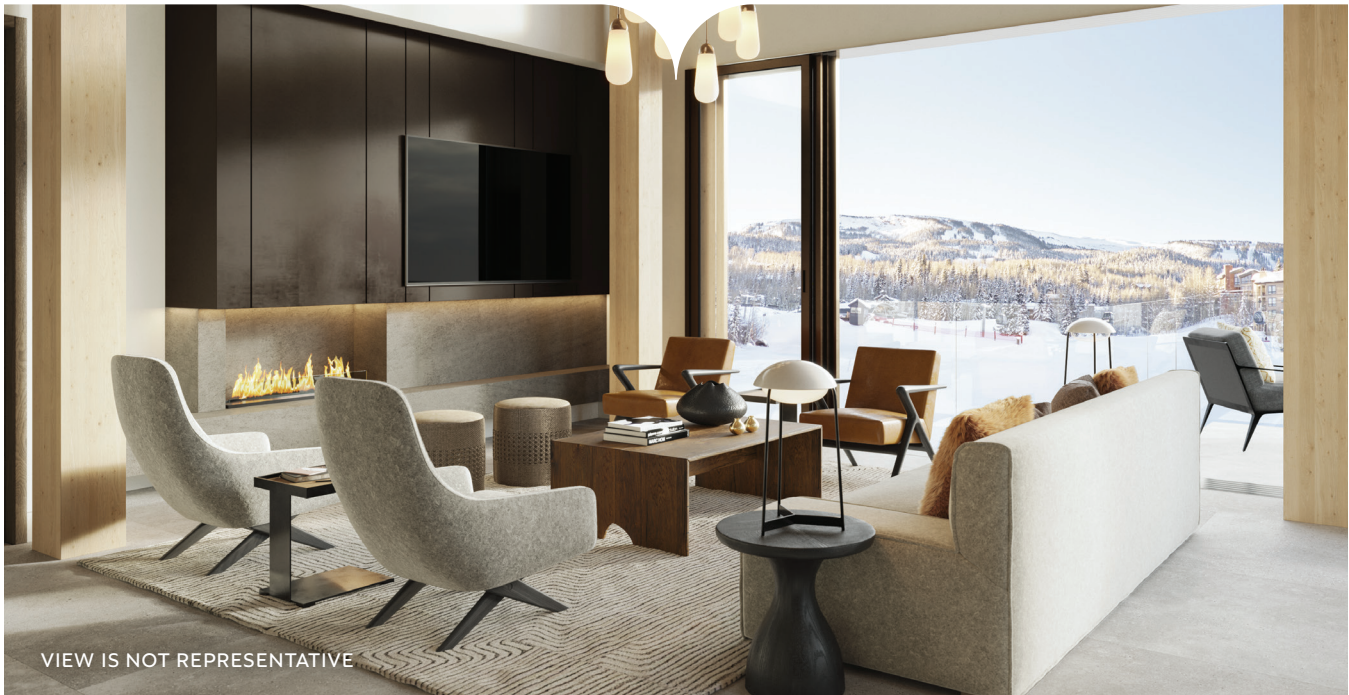
VIEW IS NOT REPRESENTATIVE