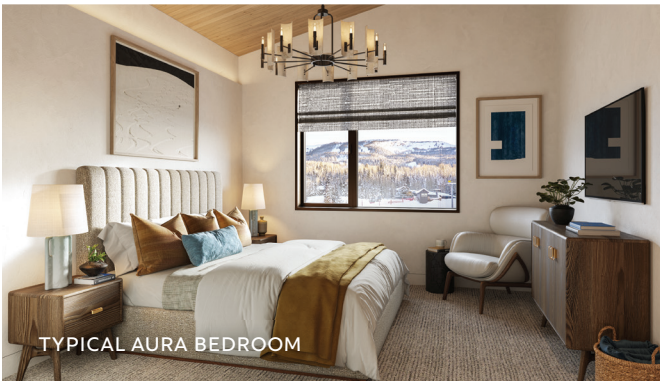
TYPICAL AURA BEDROOM