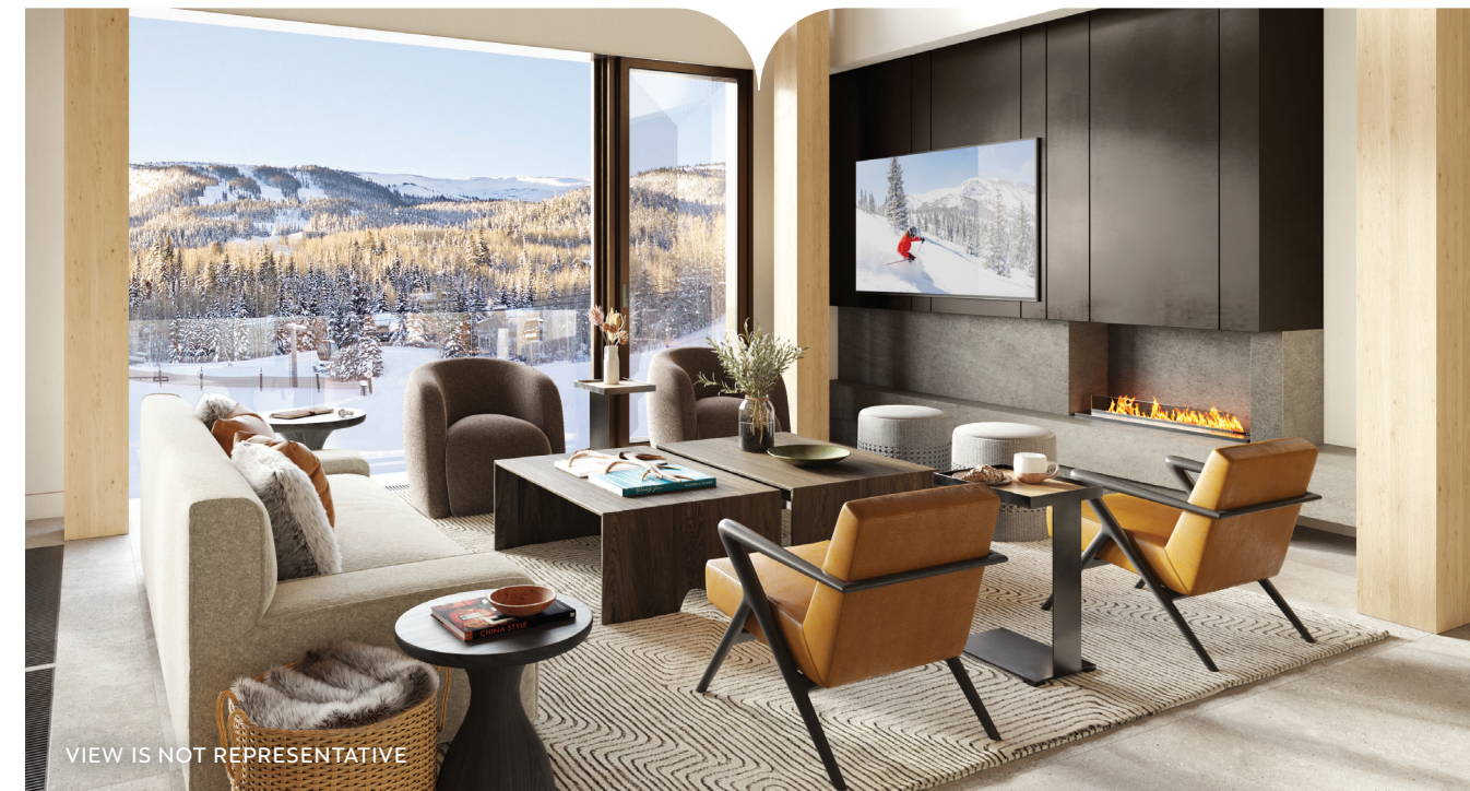
VIEW IS NOT REPRESENTATIVE