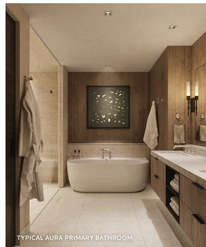
TYPICAL AURA PRIMARY BATHROOM