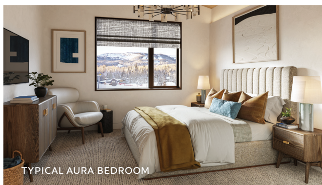
TYPICAL AURA BEDROOM