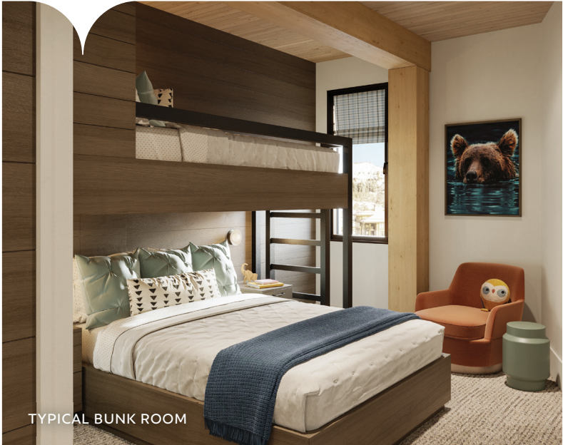
TYPICAL BUNK ROOM