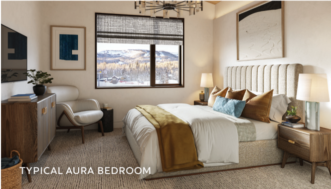
TYPICAL AURA BEDROOM