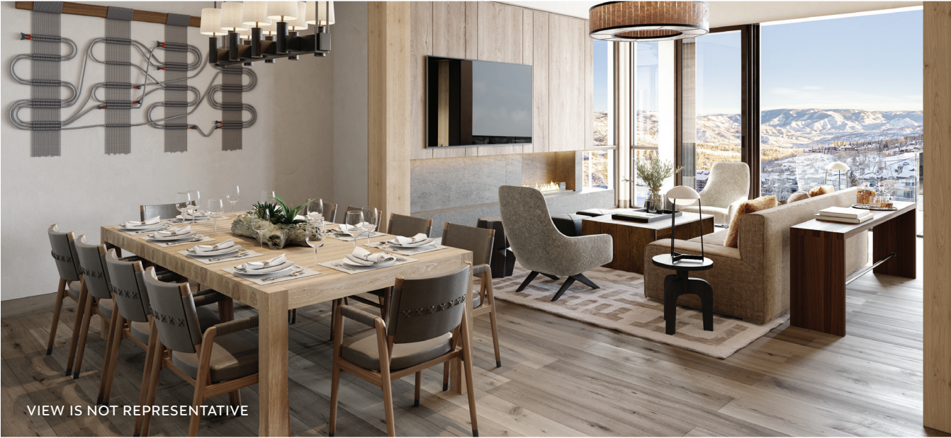
VIEW IS NOT REPRESENTATIVE