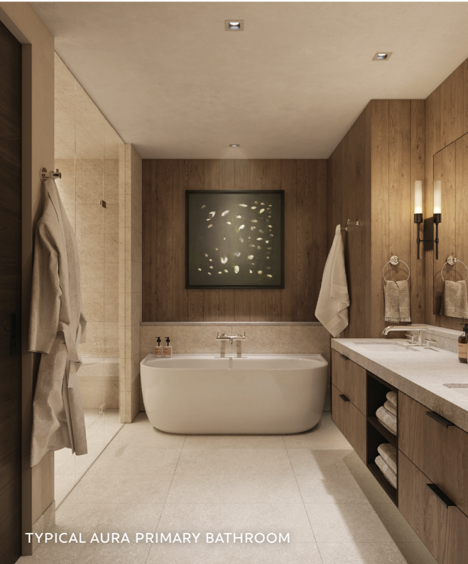
TYPICAL AURA PRIMARY BATHROOM